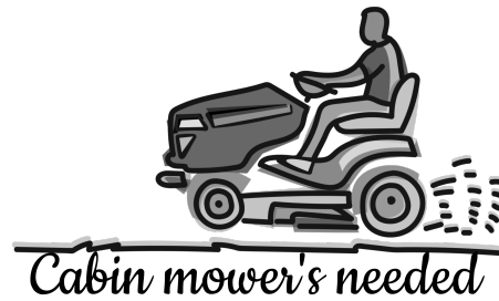
Cabin mower's needed

W 330 N ( please note corrected address ) in Shipshewana for a time of food, fellowship and fun! Multiple games streaming at once, three point shooting contest, free throw shooting contest! Sign up in the lobby!