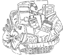
Gifts for Residents

W omen's ministry has exciting things happening over the holidays. Look for your opportunity to purchase gifts for the The Waters residents again this year. There will be a tree on the sign-up table next Sunday with gift tags you can pull off. More info will be in your mailbox next week.