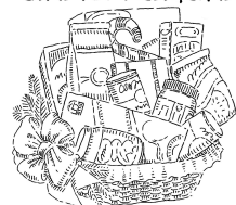
Gifts for Residents

W omen's ministry wants to bless the residents of The Waters. Look for your opportunity to purchase gifts for them. There is a tree on the sign-up table with gift tags you can pull off. Return your gifts in a bag with the gift tag attached to it by December 11 and Women's Ministry will wrap it and deliver it.