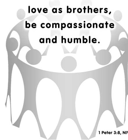
1 Peter 3:8, NIV

Live in harmony with one another; be sympathetic, love as brothers, be compassionate and humble.