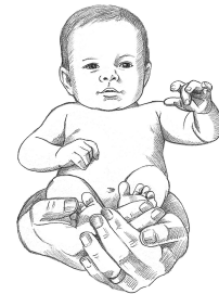
We Dedicate This Child