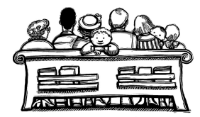
Who's New in the Pew?