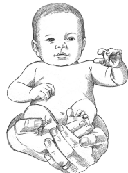
We Dedicate This Child