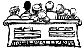
Who's New in the Pew?

April 30 - 3 p.m. Marion Christian Fellowship 5460 N 450 W Contemporary Worship service - Let's worship together!