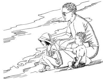
Happy Father’s Day!

*What do you call a bear with no teeth? A gummy bear!